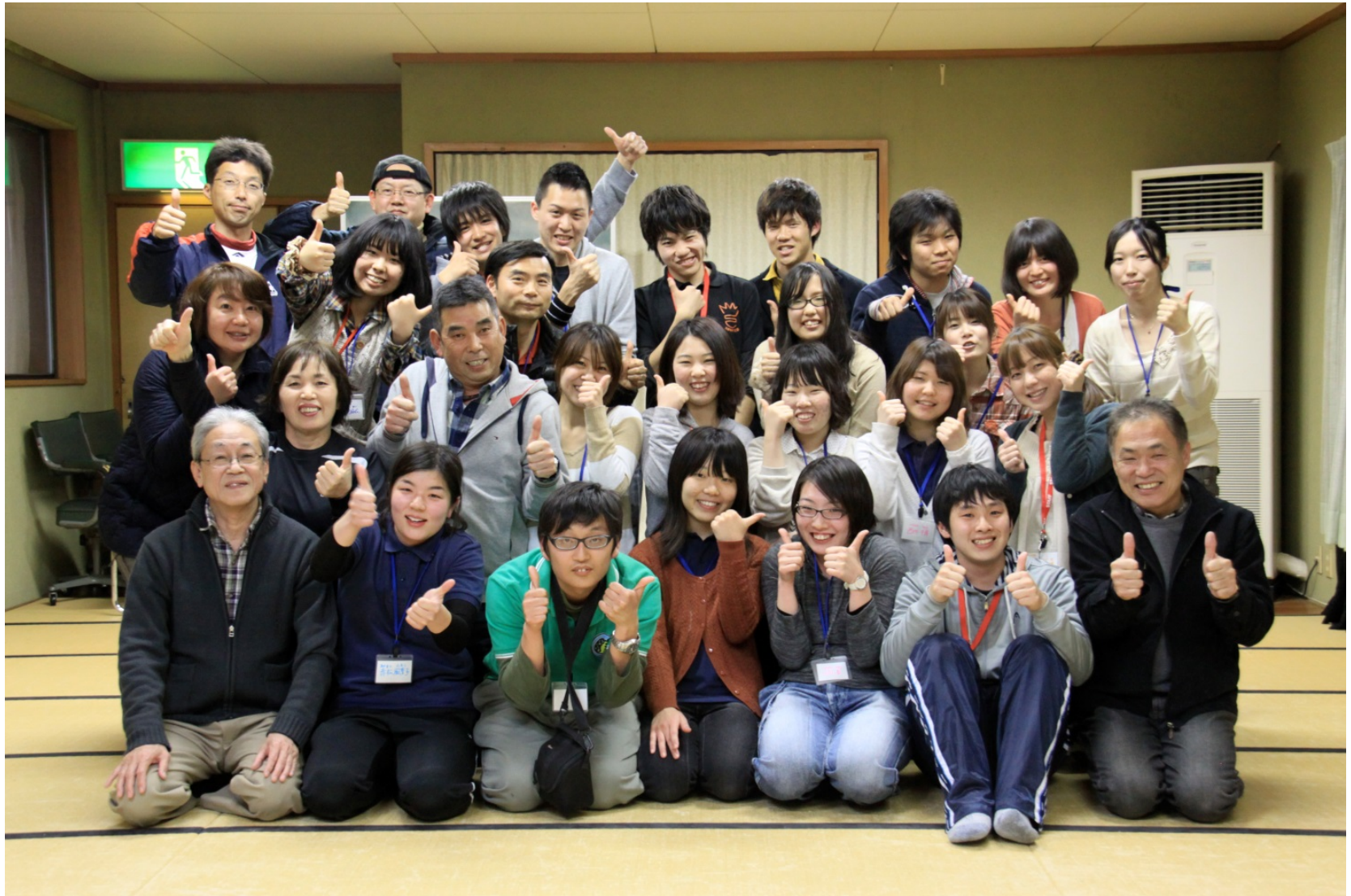
Wa Café student staff with members of the Naoshima community