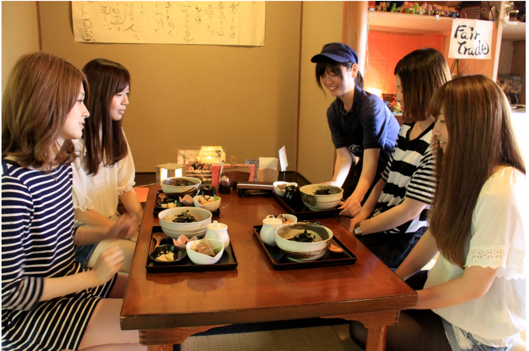
Wa Café student staff serving customers