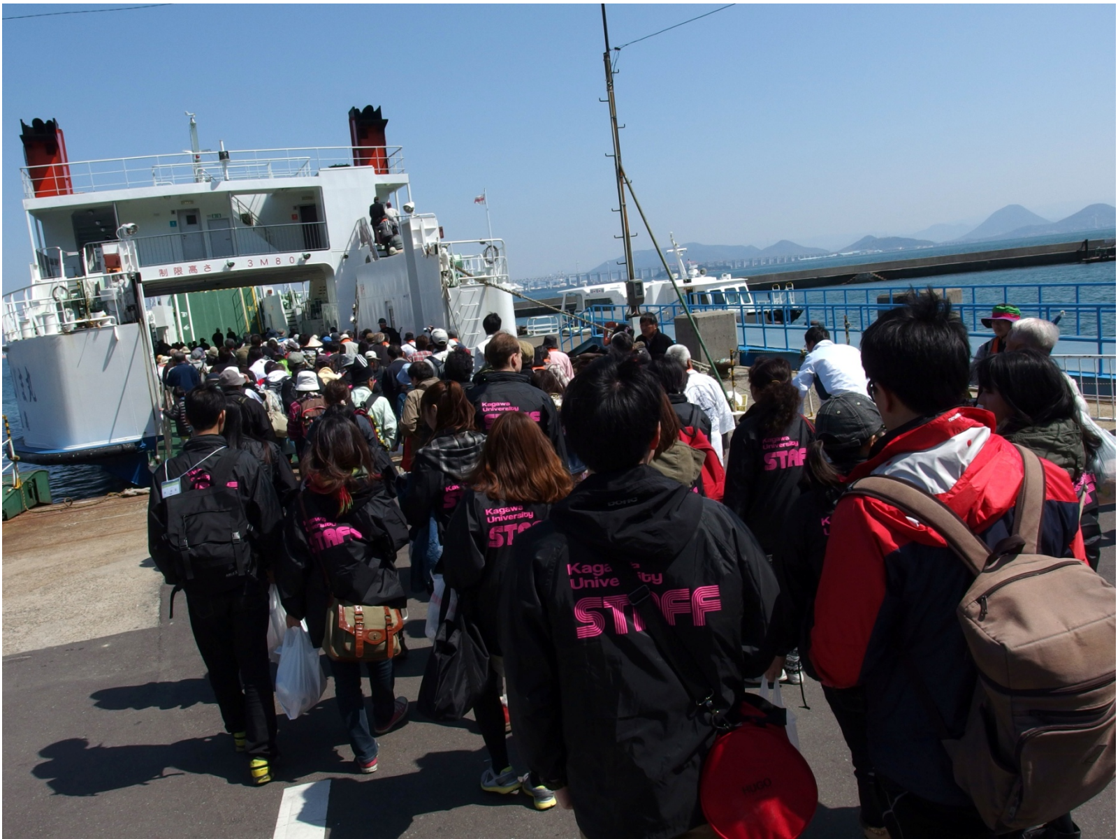
Students embarking a ferry for the islands