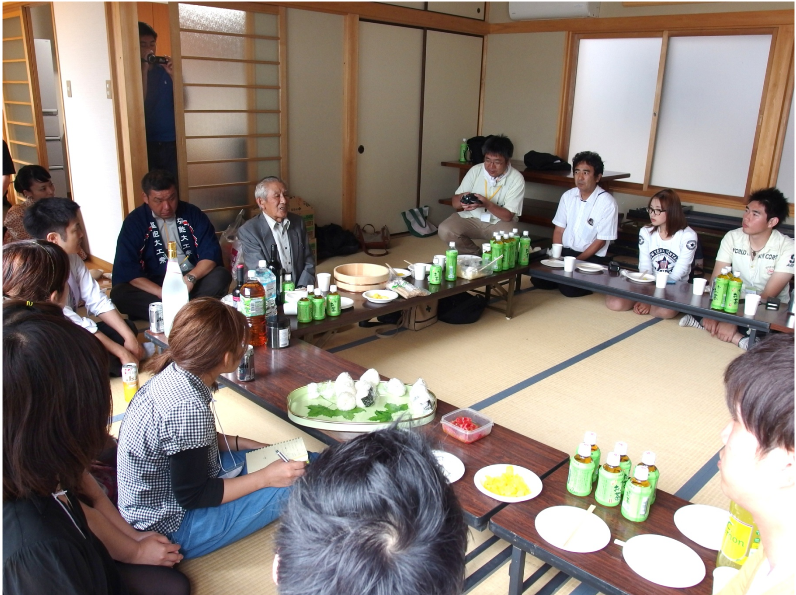
International students listening to a Honjima elder telling a story