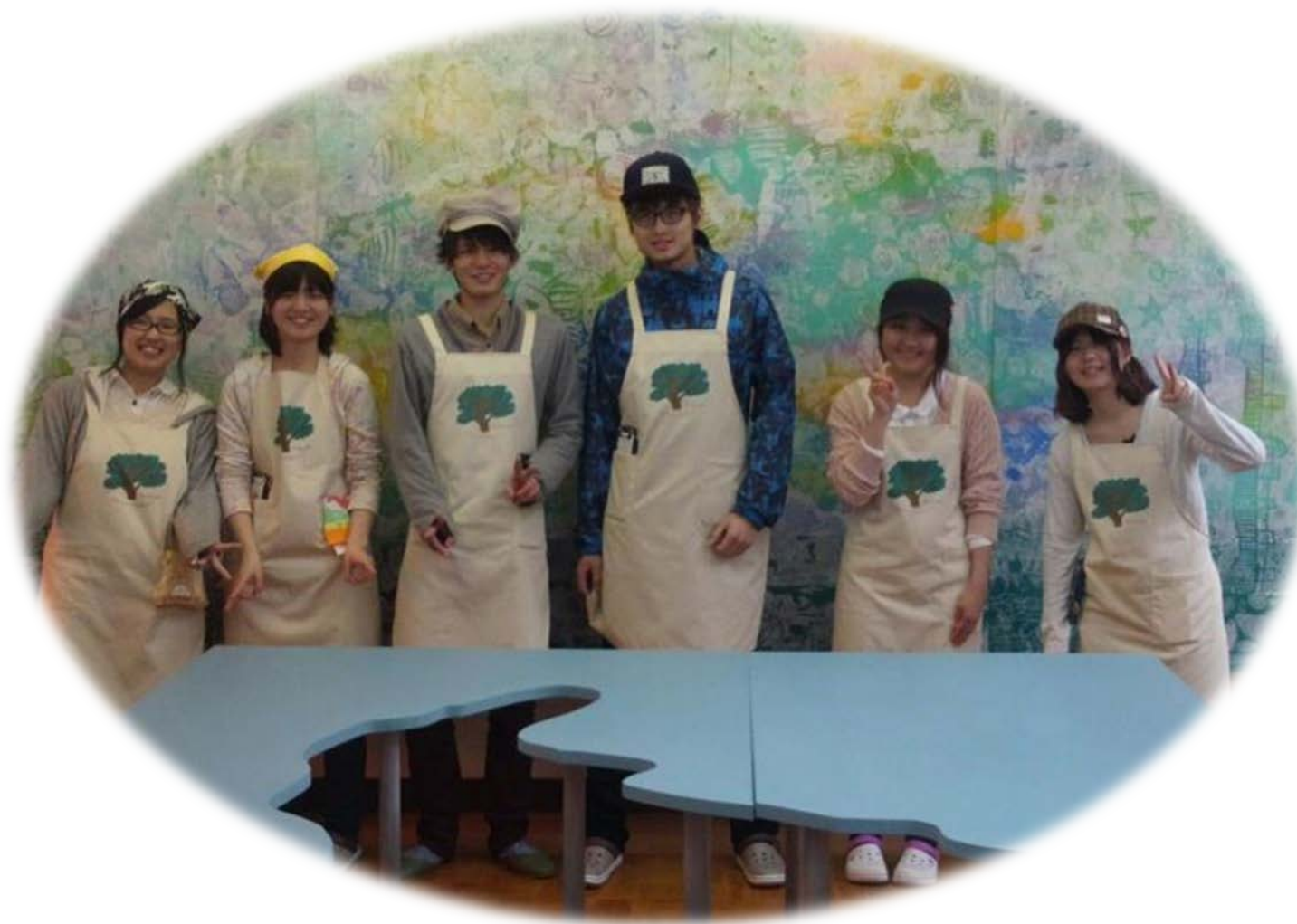
Kagawa University 'Enoki' Café (Sakaide City, Shami Island Project)