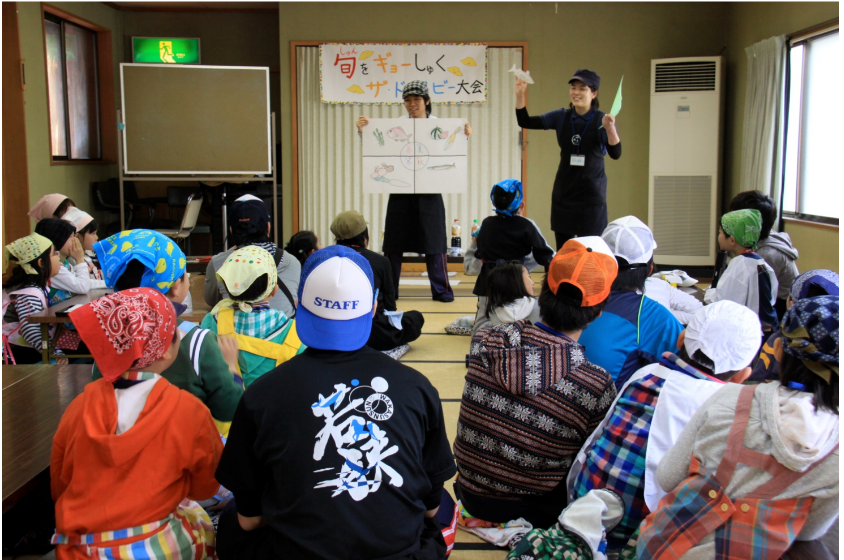
Wa Café student staff with school children of Naoshima