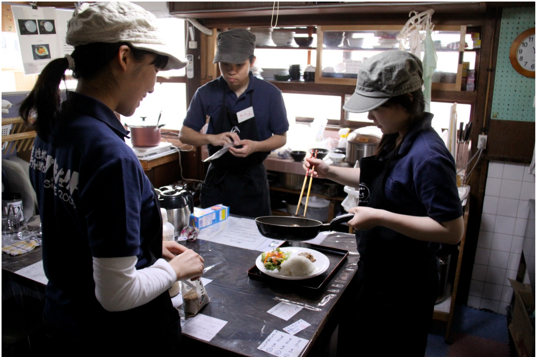
Wa Café student staff in the kitchen