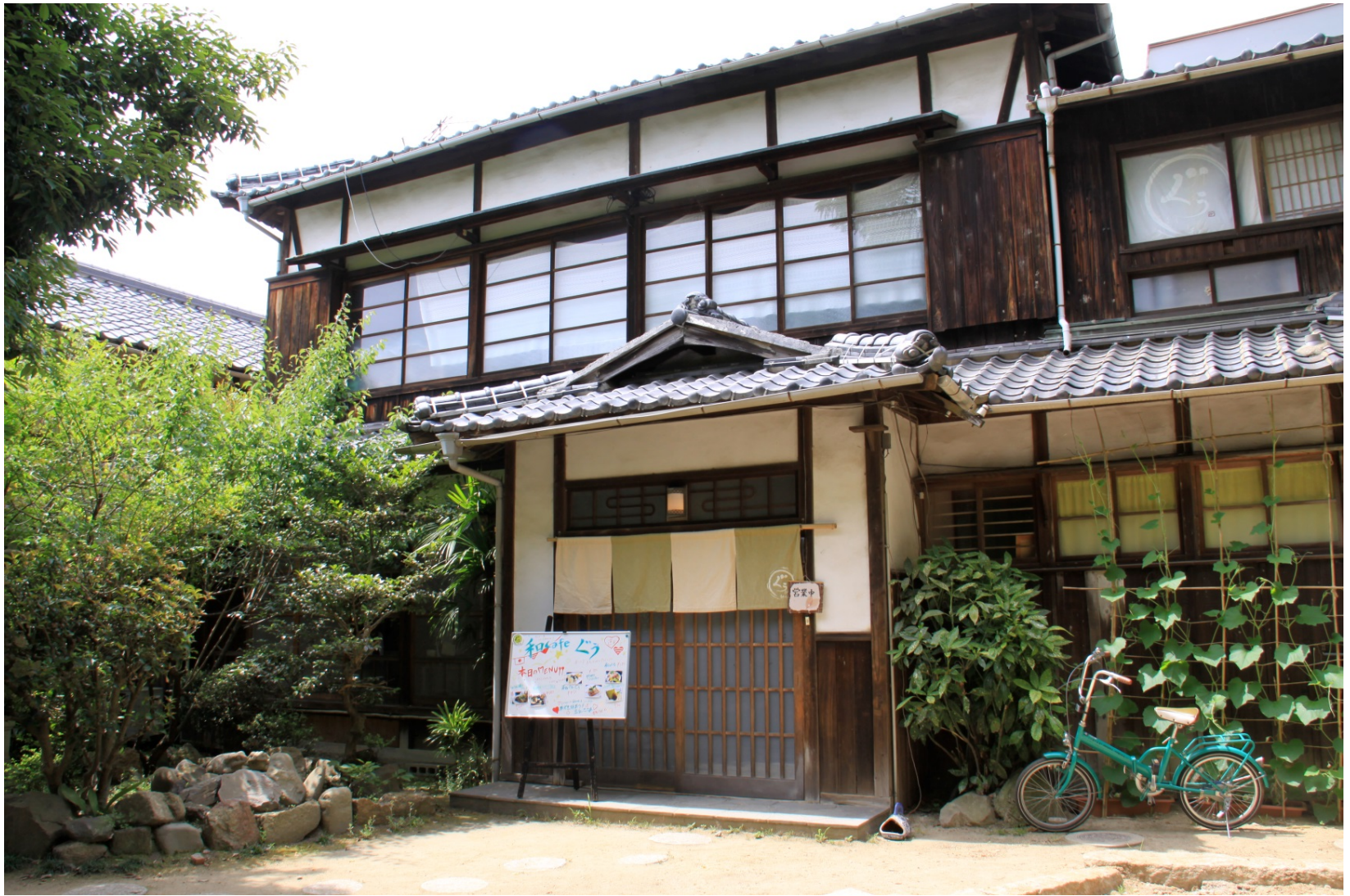
View of Wa Café from the outside