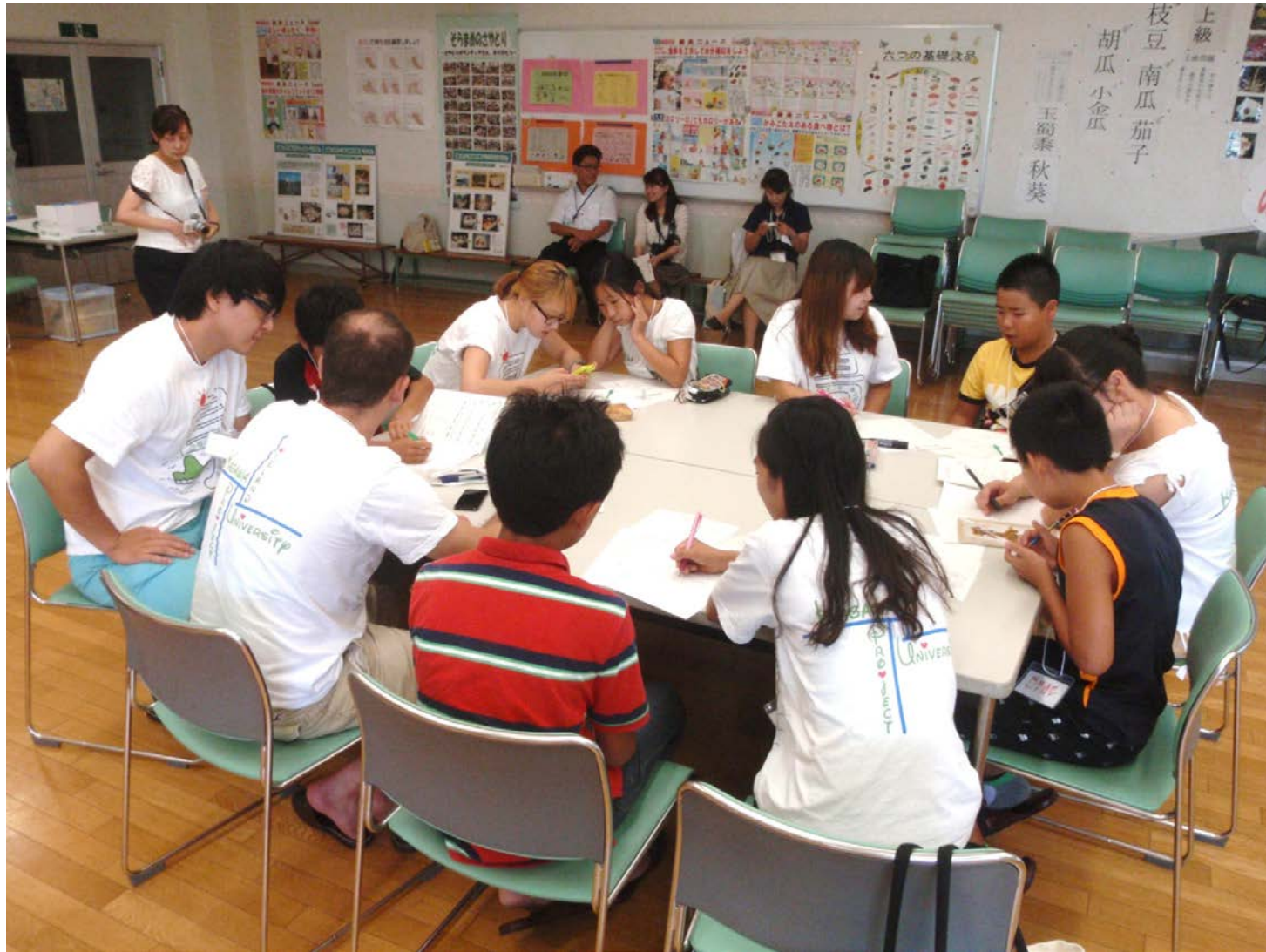
International students having a joint study session with primary school children at Takuma town