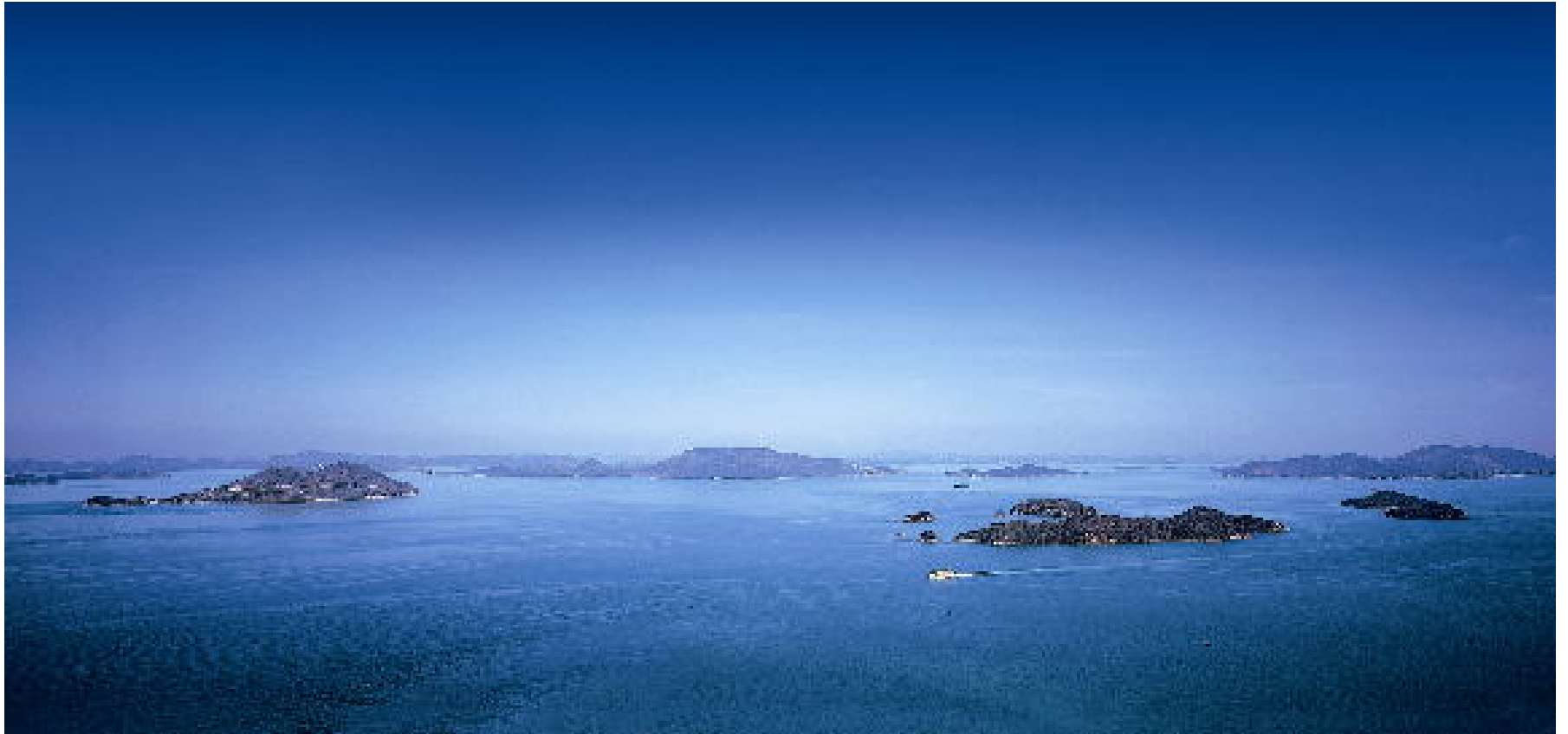
View of Seto Inland Sea